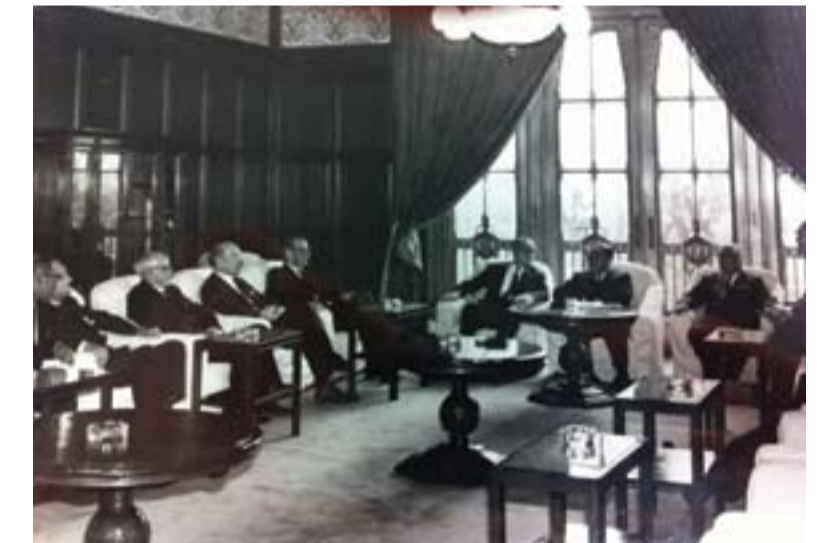
Left: 5th Joint Meeting in Tokyo Right: 10th Joint Meeting in Kyoto