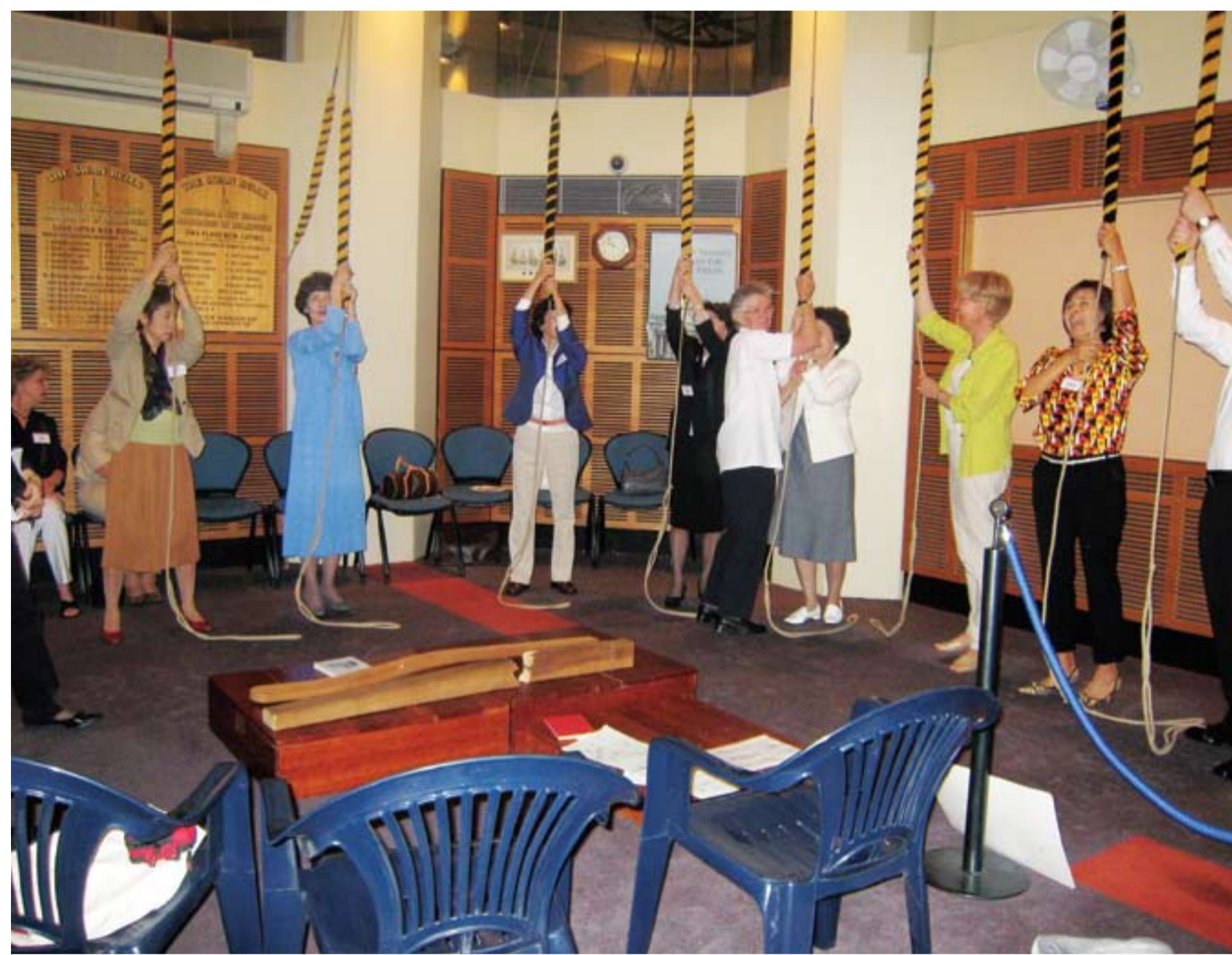
Left & Right: Perth –Bell Tower, Perth, 14 October 2008