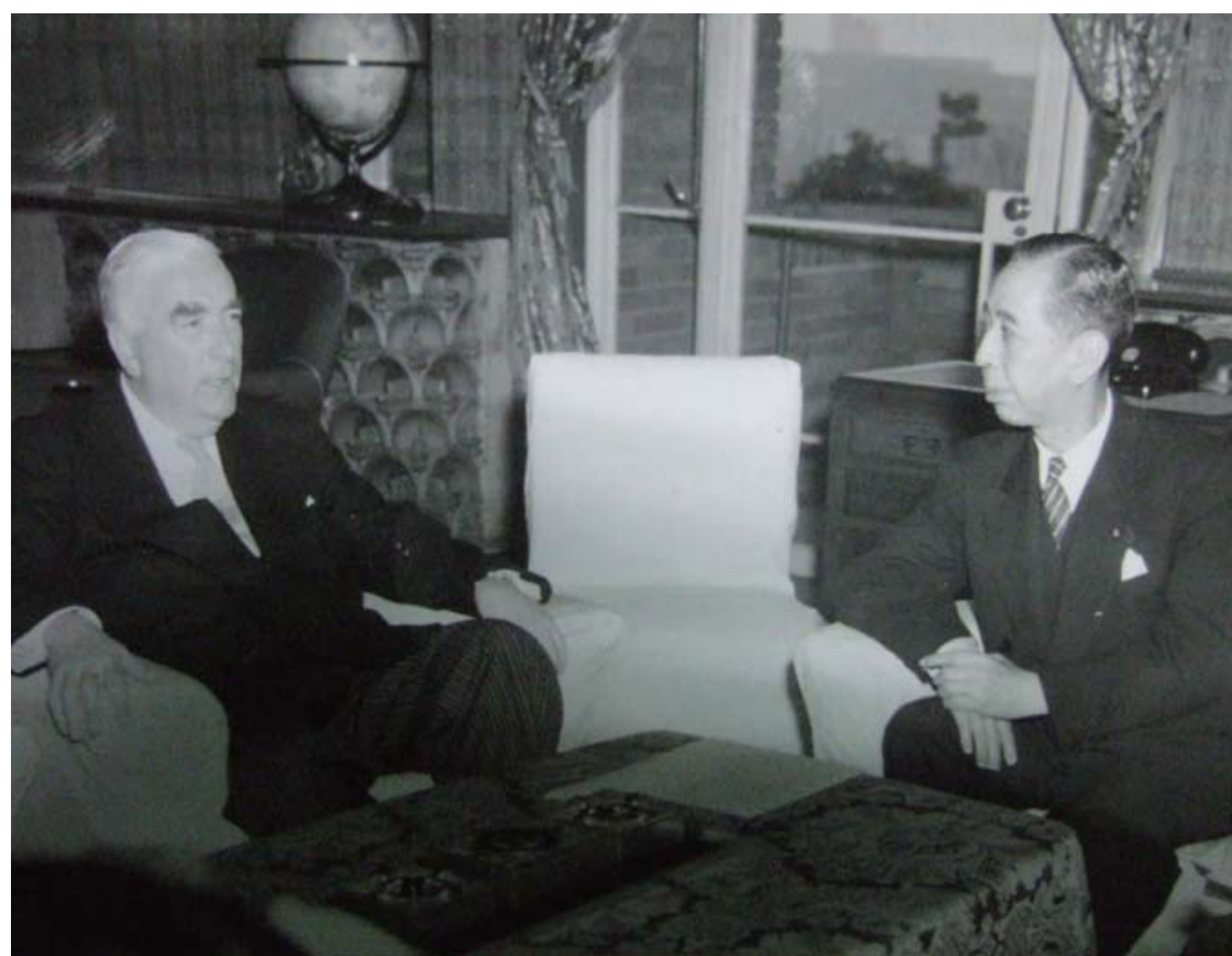
Prime Minister Menzies at Prime Minister Kishi's official residence in Meguro, Tokyo, 18 April 1957.