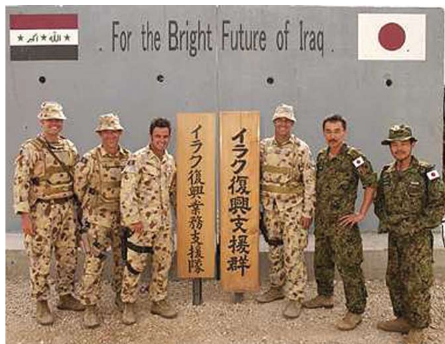
For the Bright Future of Iraq: Australia and Japanese Forces in al-Muthanna Province, 2006.