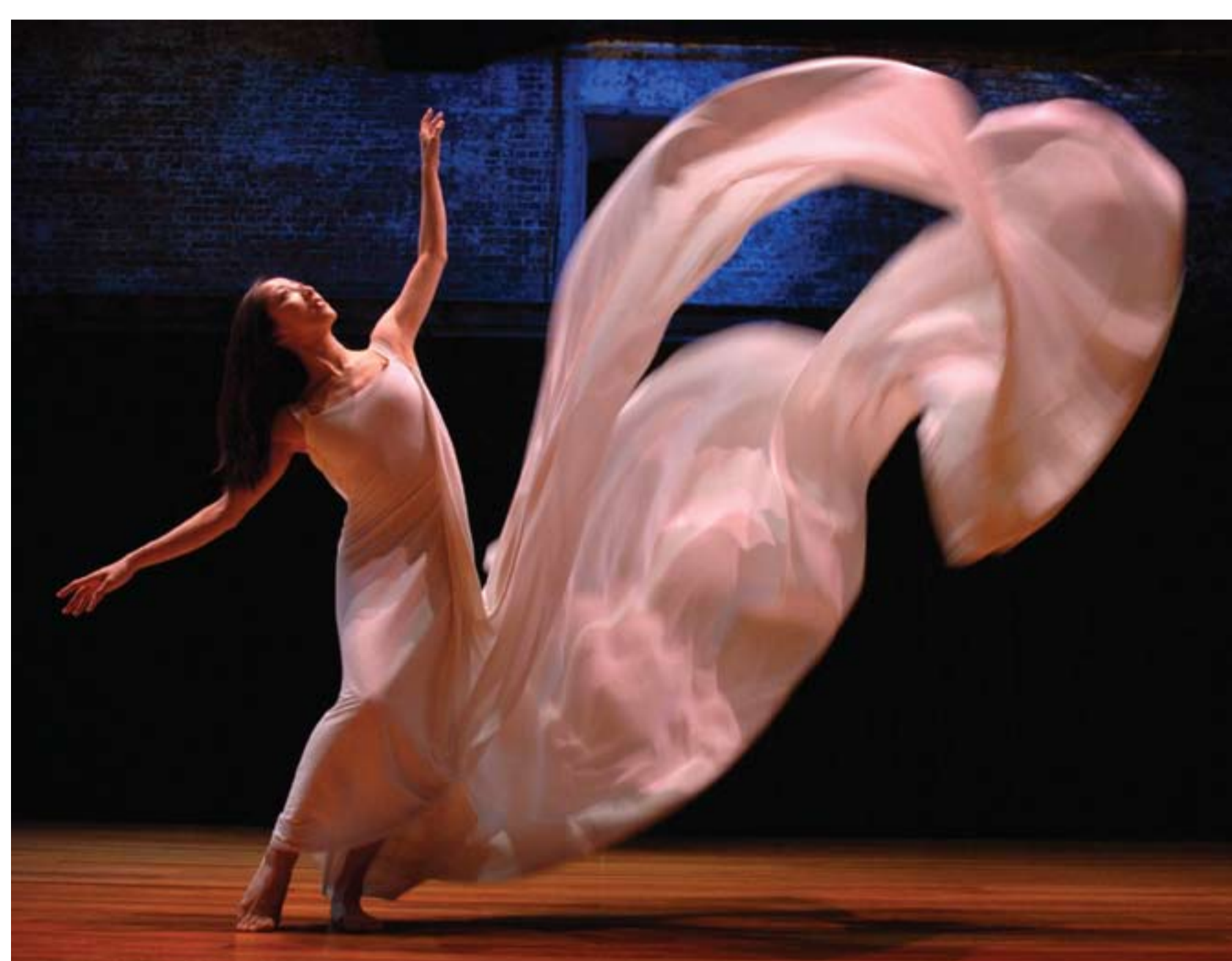
Wakako Asano and Australian Contemporary Dance 1990's. (Newsprint)