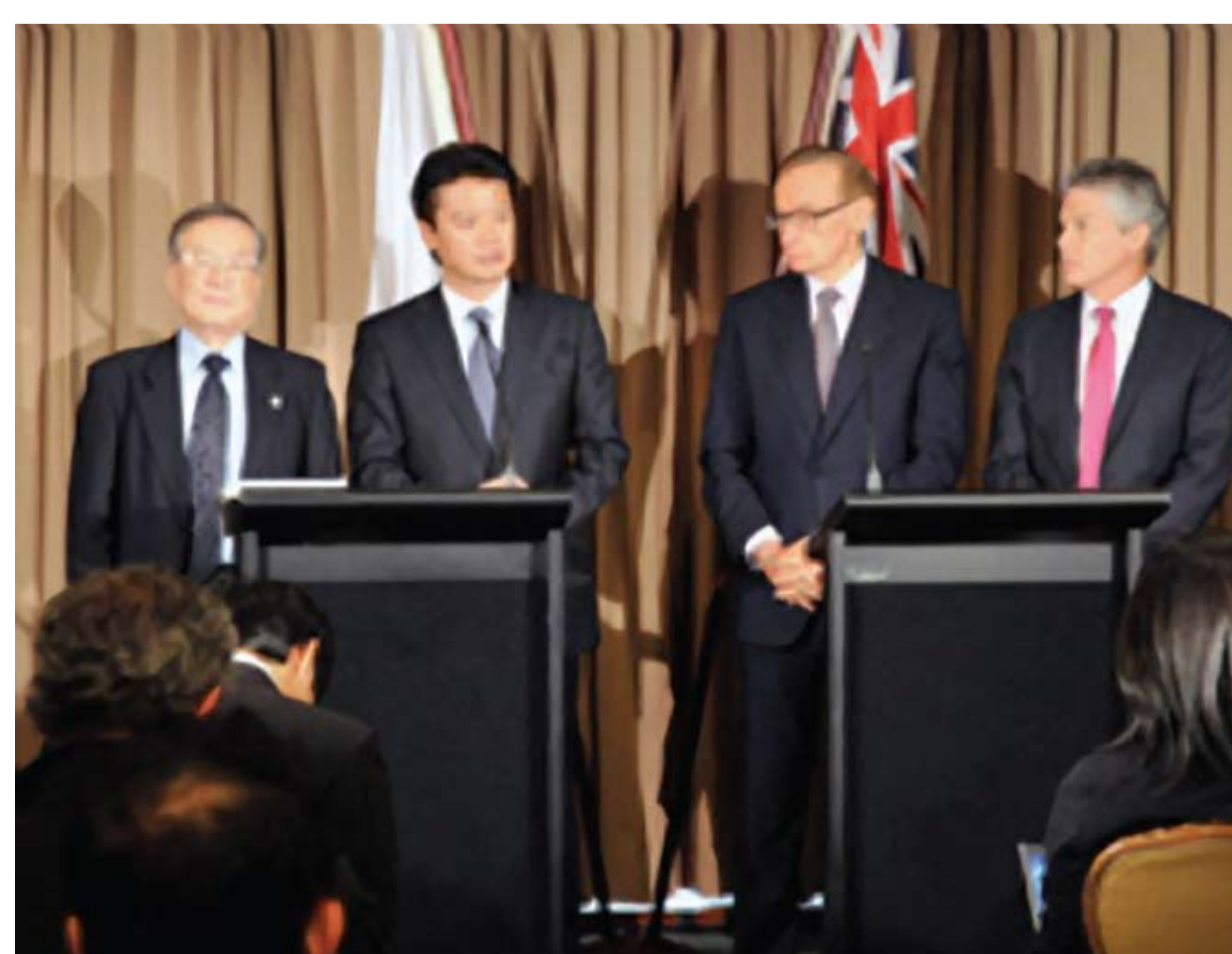
4th Australia Japan Foreign-Defence Joint Press Conference, September 2012