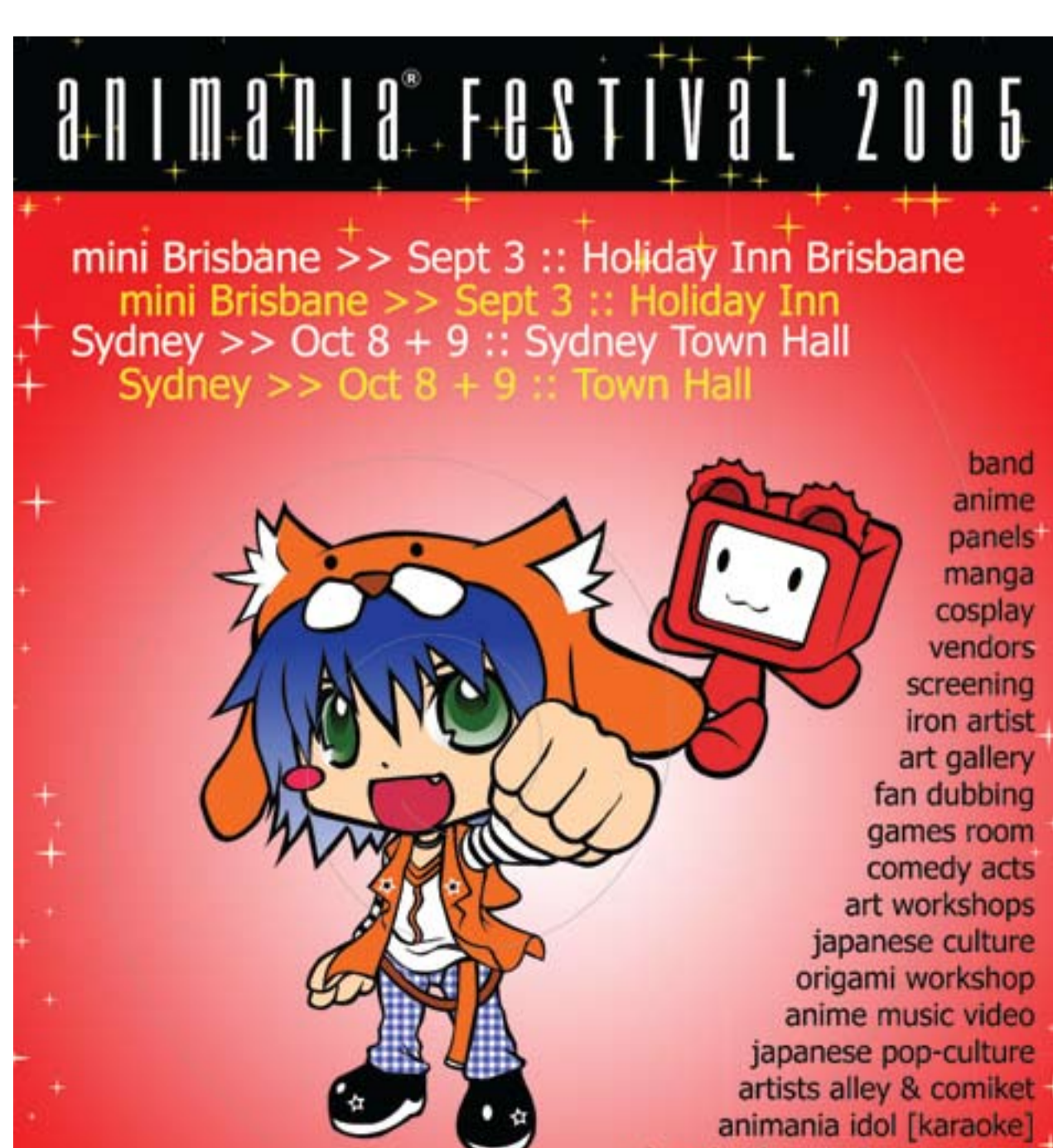
The Sydney 2005 Animania Festival.