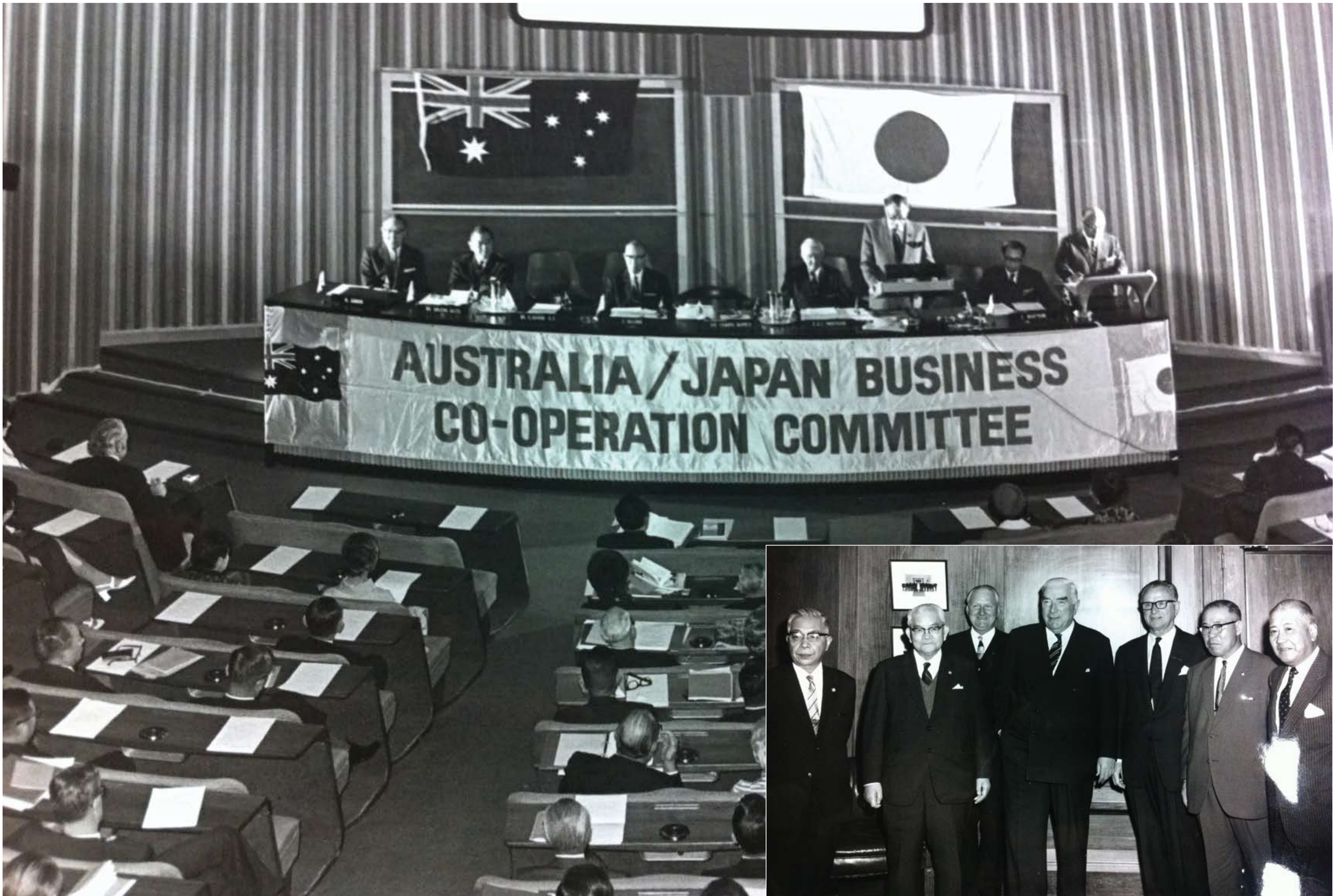
Prime Minister Menzies headed Delegates and Observers for 2nd Joint Meeting in Canberra