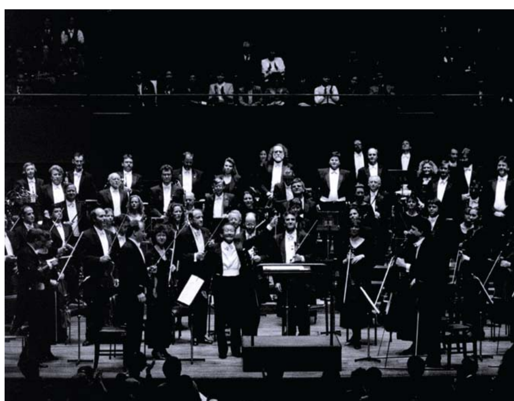
Maestro Iwaki and the Melbourne Symphony Orchestra.

Many Australian teenagers and young adults have become fascinated by Japanese comic books (manga) and films (anime).