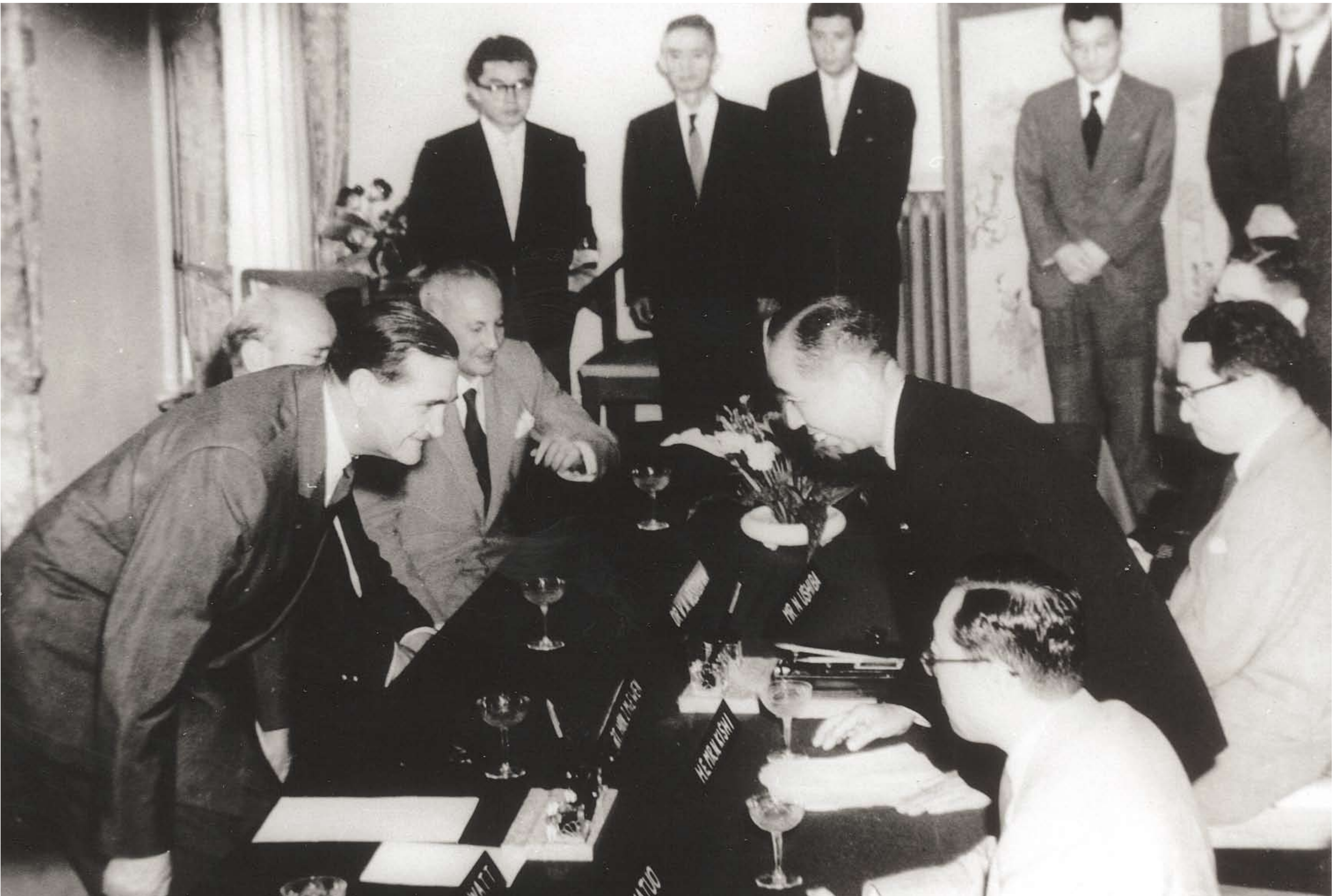
Australian Trade Minister John McEwen and Japanese Prime Minister Nobusuke Kishi signing the Australia - Japan Commerce Agreement at Hakone, Japan, 6 July 1957.