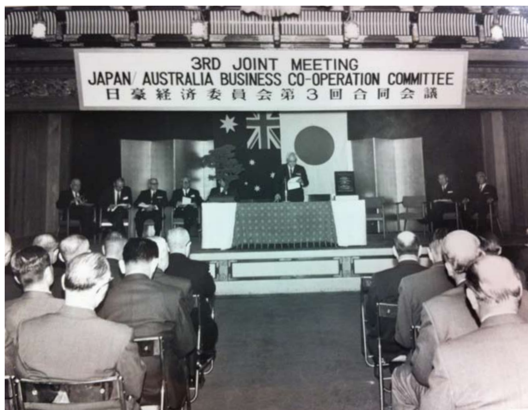
3rd Joint Meeting in Tokyo