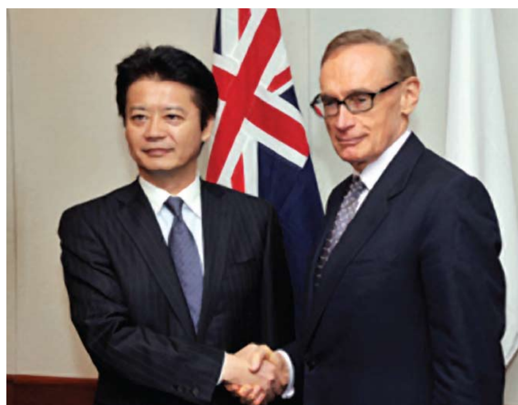
4th Australia Japan Foreign-Defence Ministers meeting, September 2012