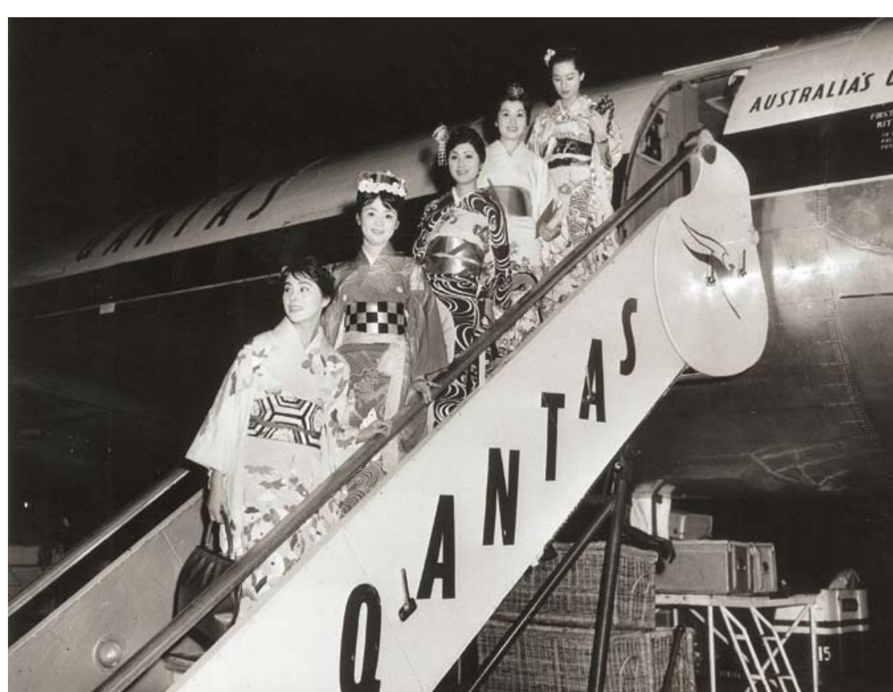
Left: A Japanese Datsun car at Bondi Beach preparing to start in the 1958 Mobilgas around-Australia trial. Right: Japanese models arriving on a Qantas plane at Mascot Aerodrome, Sydney, for the Nitto Boseki fashion parade at Mark Foy's Department Store, 2 April 1959.