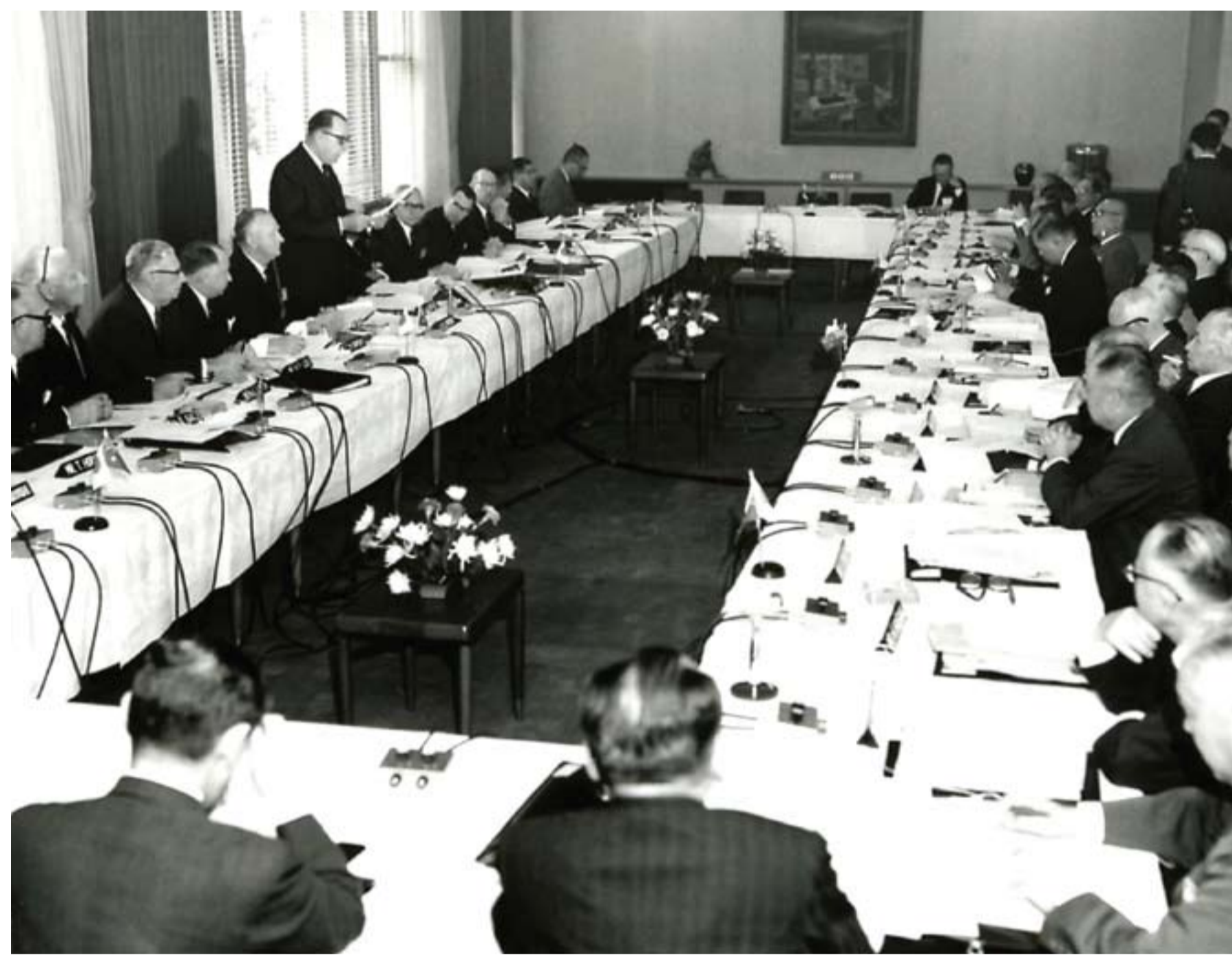
1st Australia Japan Business Cooperation Committee Joint Meeting in Tokyo, 16-17 May 1963