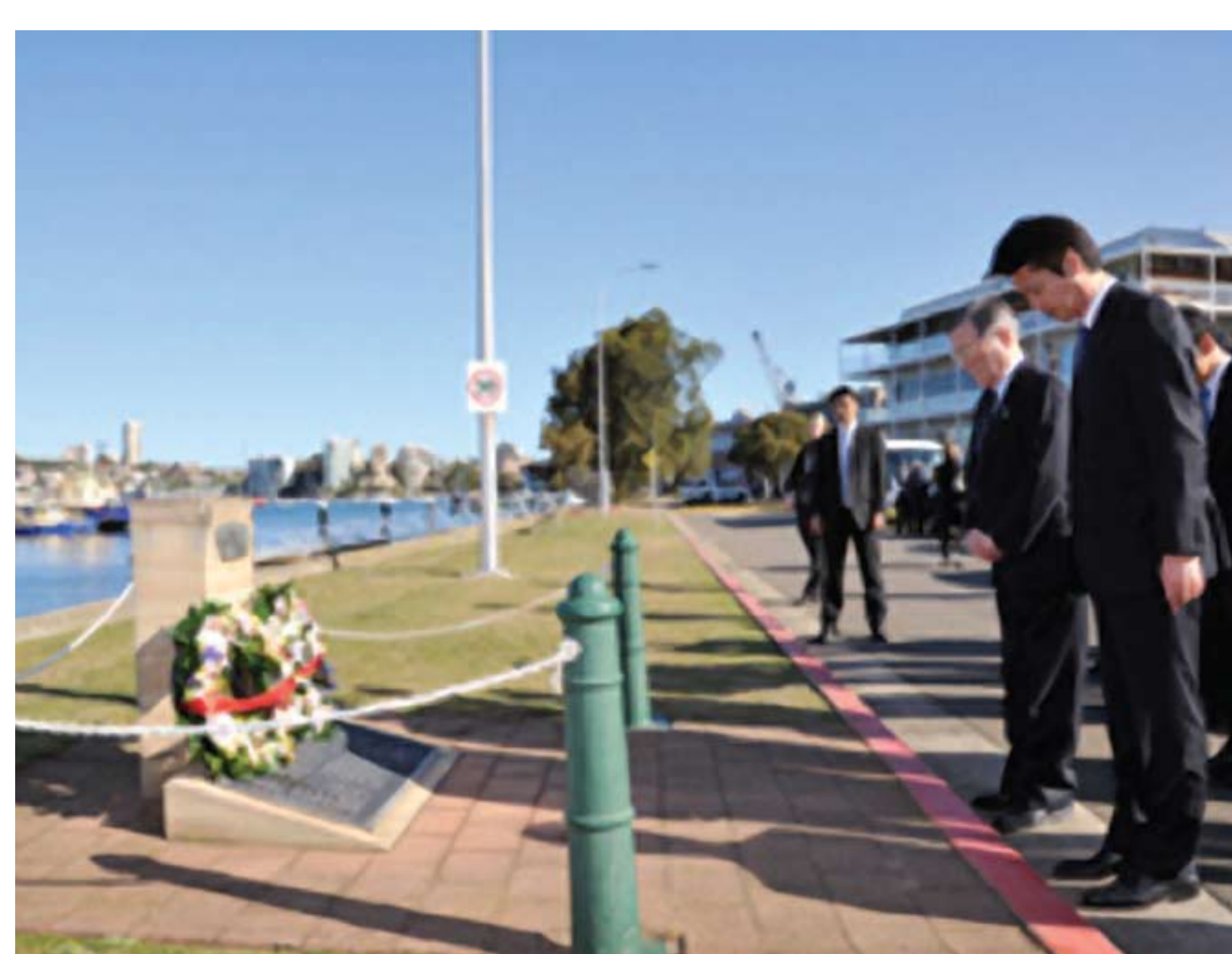
Visit Kuttubul Navy Base, September 2012