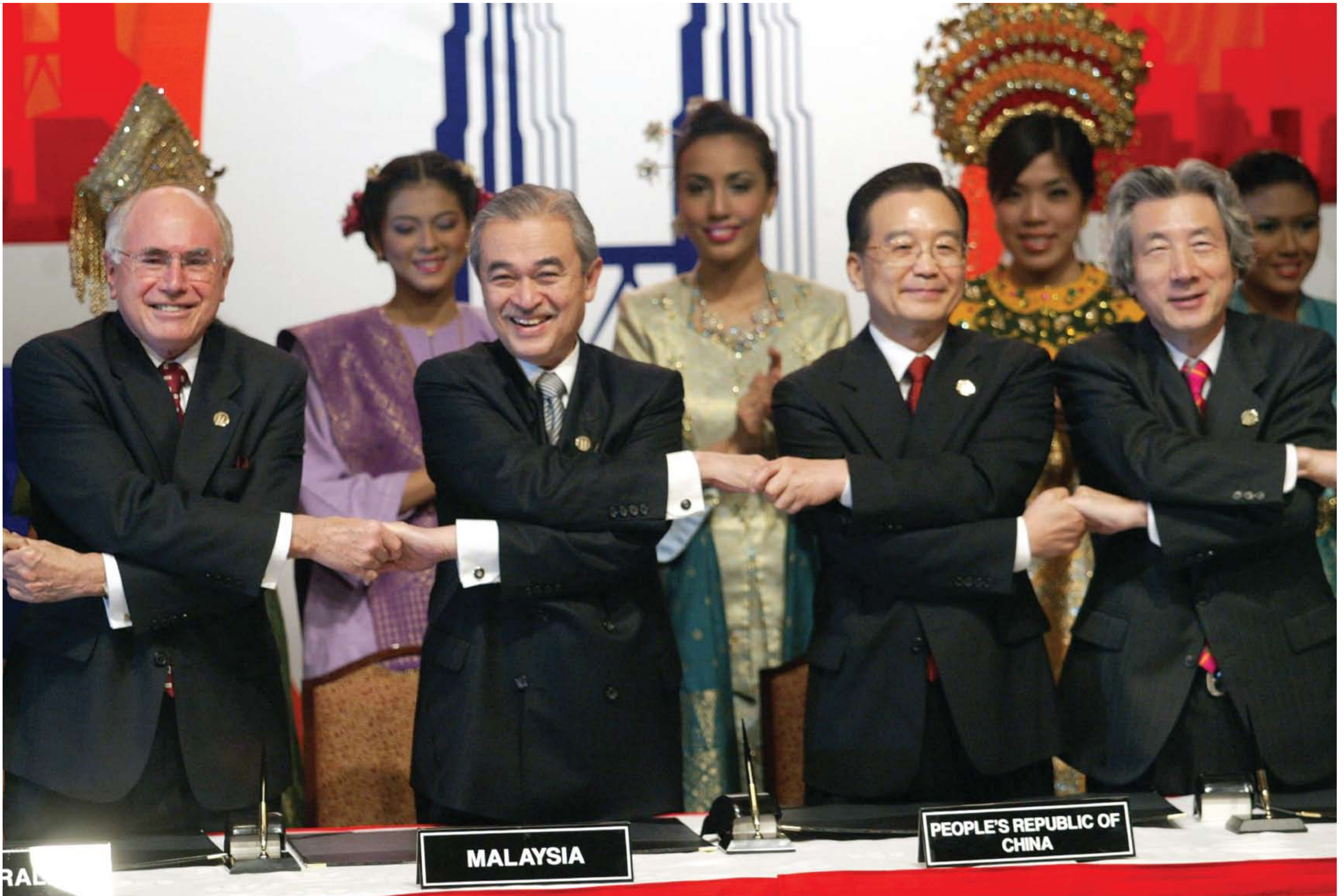
Australian and Japanese Prime Ministers at the first East Asia Summit in Kuala Lumpur in December 2005.