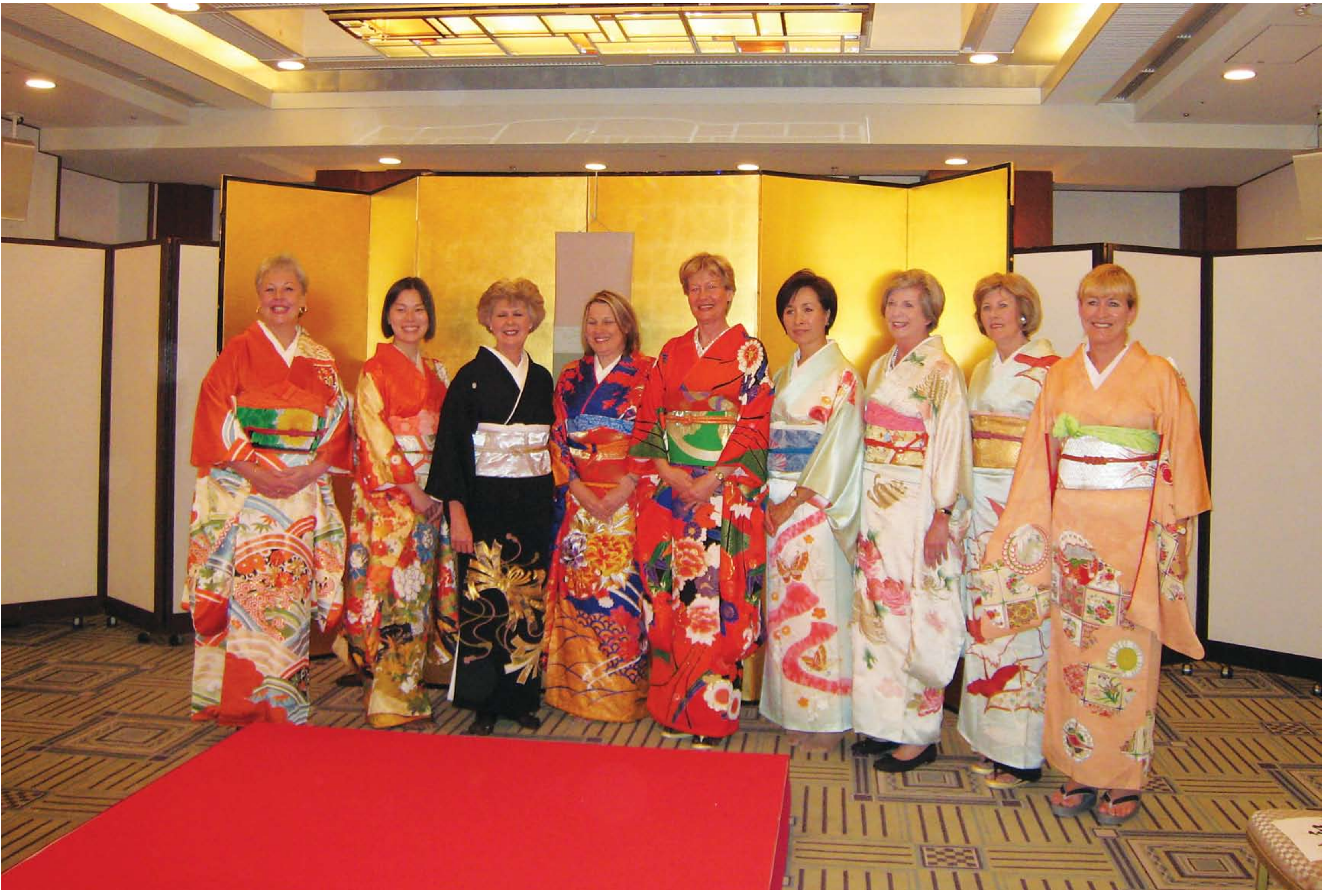
Tokyo – Kimono 23 October 2007