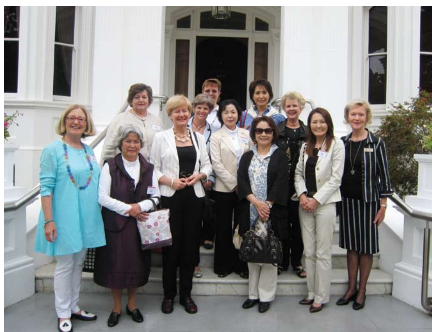
Left & Right: Brisbane, 11 October 2010