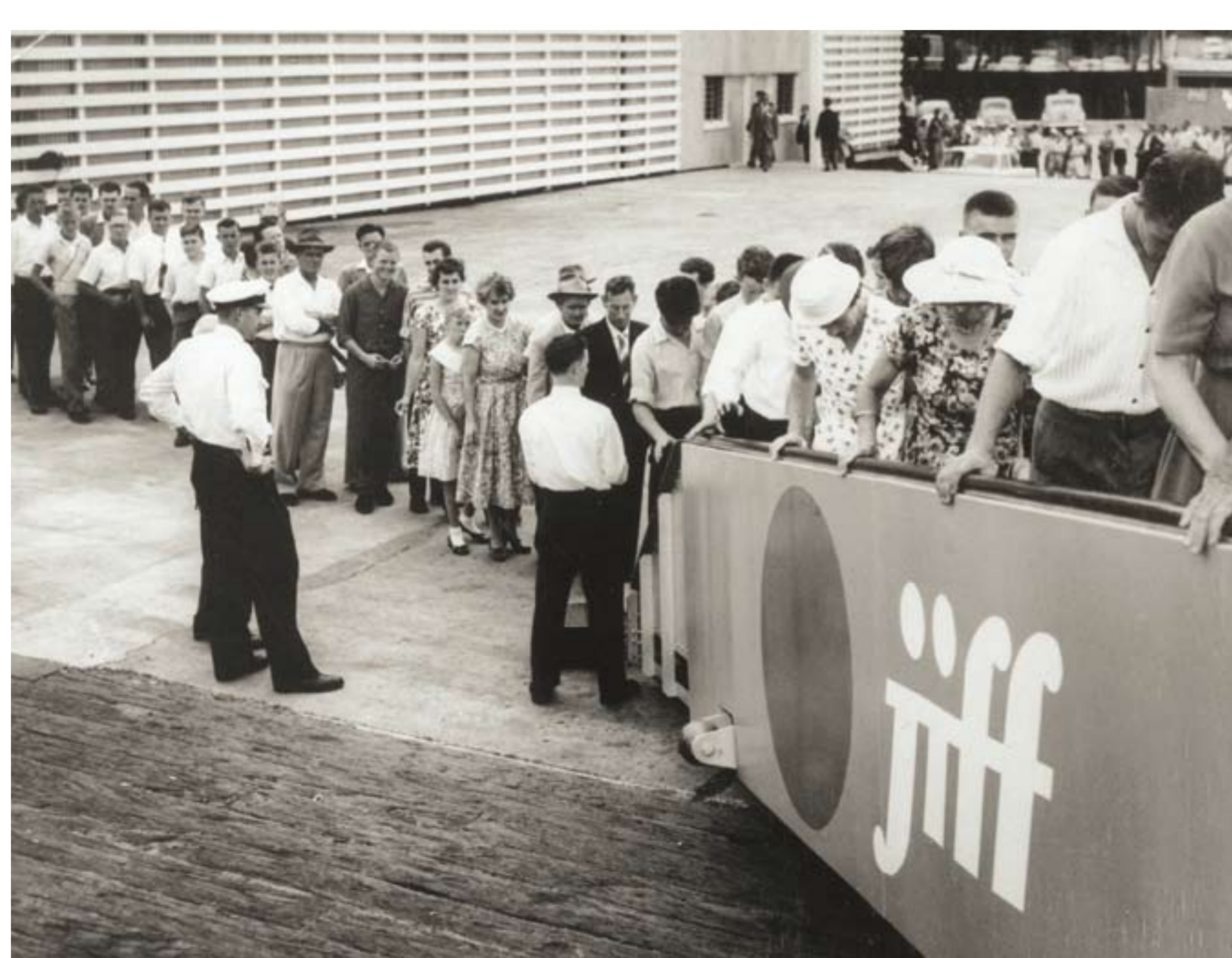
Left: The Aki Maru berthed at Outer Harbour, Adelaide, 18 December 1960. Right: A long queue of Brisbane people waiting on board the Aki Maru, 1 December 1960.